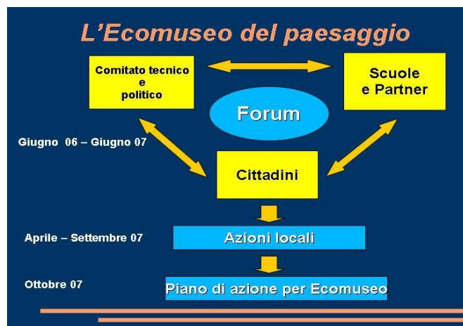
Operating scheme of the Ecomuseum

The Technical and Political Committee is the place aimed at sharing the path and linking the Forum, the planning and implementation of Local Actions. It is made up of a group of technicians belonging to the Scientific Committee and of the various sectors of the Municipality of Parabiago and by the assessors of Environmental Policies, Urban Planning and Education, involved in the process. It meets at least annually, monitoring the process of involving the Local Actors and contributing to the definition of Local Actions and this Action Program.