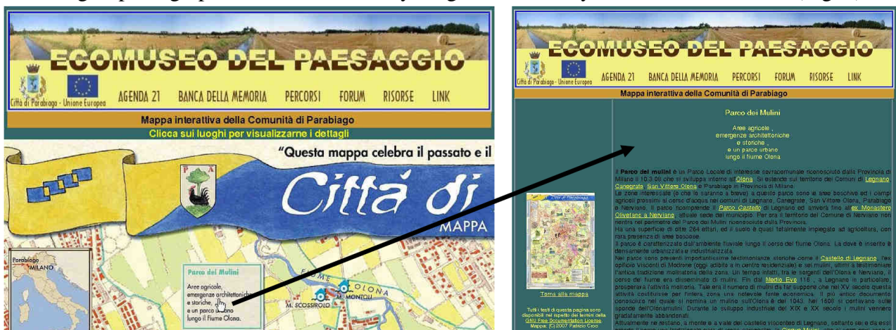
Fig. 1 Interactive parish map

Each object represented on the map is connected by a hyperlink to a in-depth web page containing text, images, photographs, interviews and anything else necessary to detail the contents. (Fig. 1)